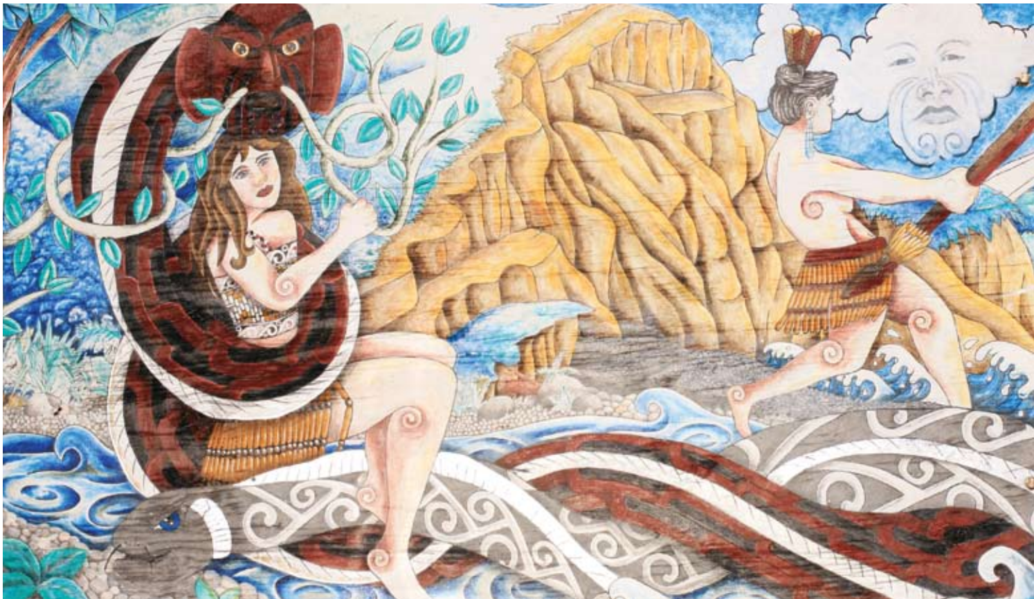
Eels are revered as gods by some cultures, including that of the Maori — as depicted in this wall mural in Canterbury, New Zealand.